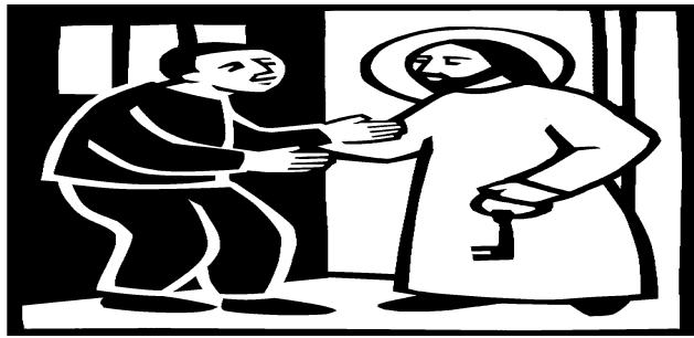
HE . SENT . ME to proclaim release to the captives